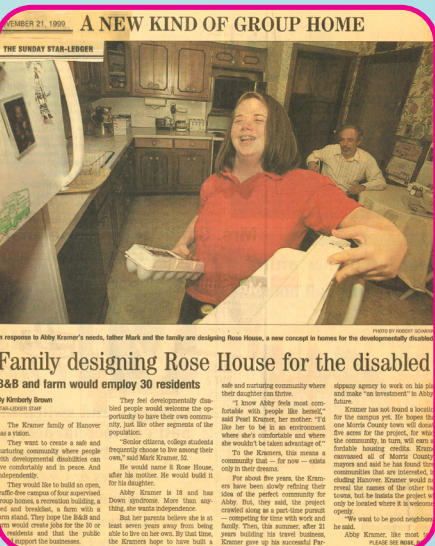
The Sunday Star-Ledger announces Rose House's opening in a 11/21/99 article.

Stay tuned to your email inbox for more information about events to commemorate this occasion. To get on our email list, please send a message to contact@therosehouse.org .